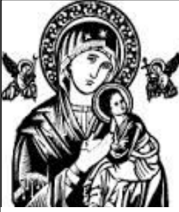
Our Lady of Perpetual Help