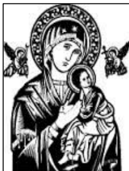
Our Lady of Perpetual Help