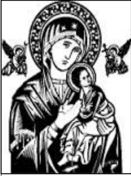
Our Lady of Perpetual Help

St Mary's Parish — Maungaturoto — Mangawhai — Wellsford Saturday Vigil MAUNGATUROTO – Mass 4.00pm (1 st & 3 rd Saturdays) 2 nd & 4 th Saturdays – Liturgy of Word & Holy Communion: 4.00pm.